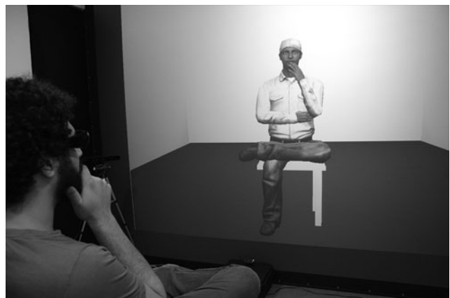
FIG. 1. Experimental setup.

Participants filled in an online demographic questionnaire about 2 weeks before the experiment. This questionnaire also contained a measure of a priori liking of the outgroup. 23 In the experimental session, they engaged with Jamil in a pseudo-natural conversation about the Israeli-constructed security fence on the West Bank—a controversial topic in the Israeli-Palestinian conflict. Jamil describes the difficulties of Palestinians' life caused by the separation fence. He presents