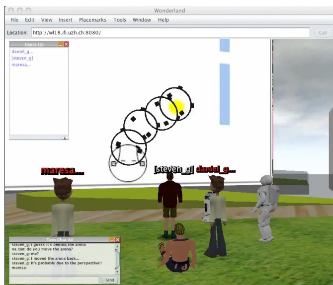
Fig. 3. Group exercise in UNIworld.

For collaborative learning in UNIworld to run smoothly it is crucial that each participating university provides their students with access to OWL from a local computer lab, as well as technical support.