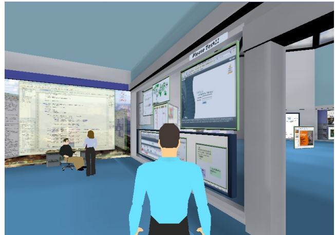
Collaboration in Wonderland: Virtual Meeting Rooms with Application Sharing Facilities. 3

integrating virtual 3D spaces is to create a sense of social presence and a feeling of “being there” [2, 4] independently of spatial or temporal constraints for the globally distributed participants, as well as to facilitate communication and collaboration among them.